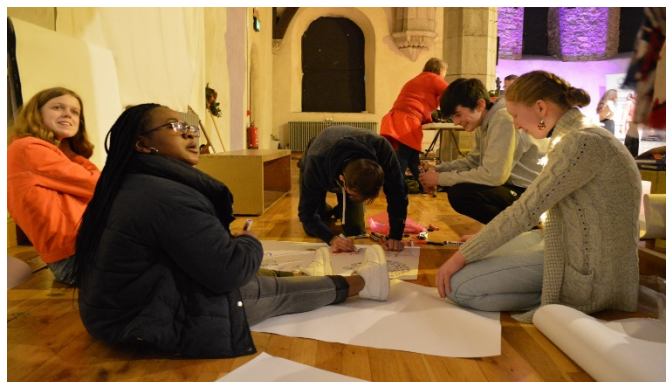
Image from LCYP's Winter Wonderland event, an alternative celebration for teenagers. December 20 th 2019 in Dance Limerick.

For information on any aspect of the LCYP programme contact lcyp@lcteb.ie or call 086 4120440